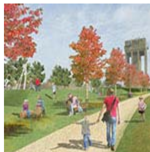
Pulley Lane Public Park