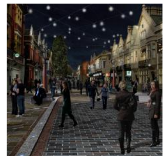
Warrington Town Centre